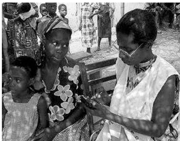
A community health worker enters measles/ITN campaign data into a personal digital assistant.

The IFRC's Health and Care Department and the Regional Health delegate provided technical assistance to ZRCS to fully develop and implement a plan of action that supported the national effort.