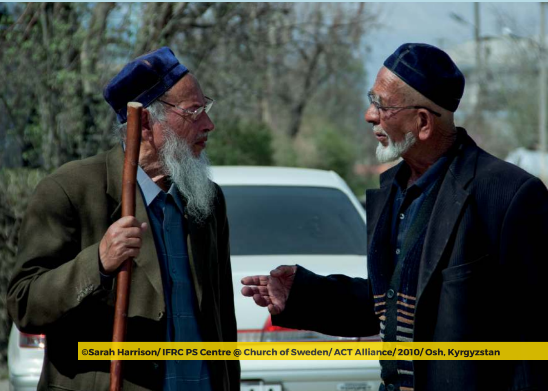
©Sarah Harrison/ IFRC PS Centre @ Church of Sweden/ ACT Alliance/ 2010/ Osh, Kyrgyzstan

During quarantine, where possible, safe communication channels should be provided to reduce loneliness and psychological isolation (e.g. WeChat).