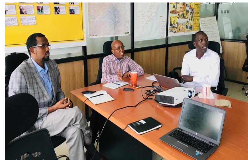
Joint (IFRC CP3 and CGPP-GHSA) planning meeting on Joint CBS training modules, (Photo by Arale).