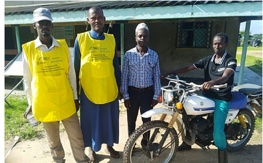
Hulugho subcounty disease surveillance with project CMs