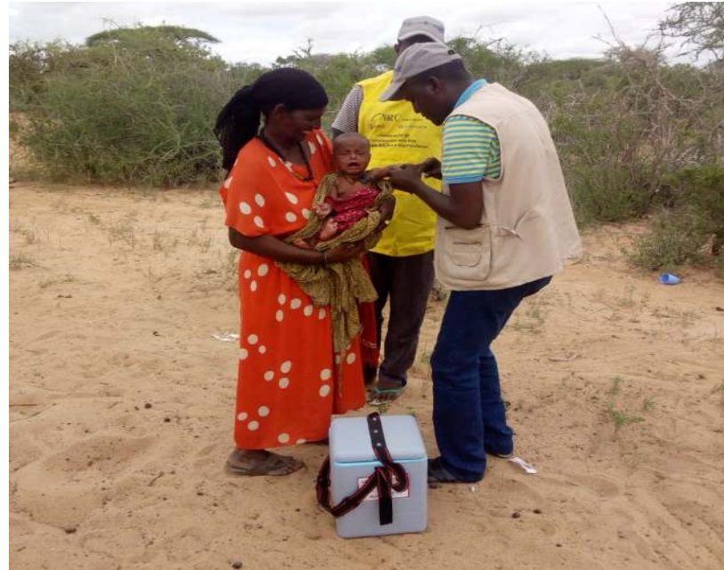
Hulugho sub-county Hospital outreach team immunizing a child along the Kenya Somalia border villages