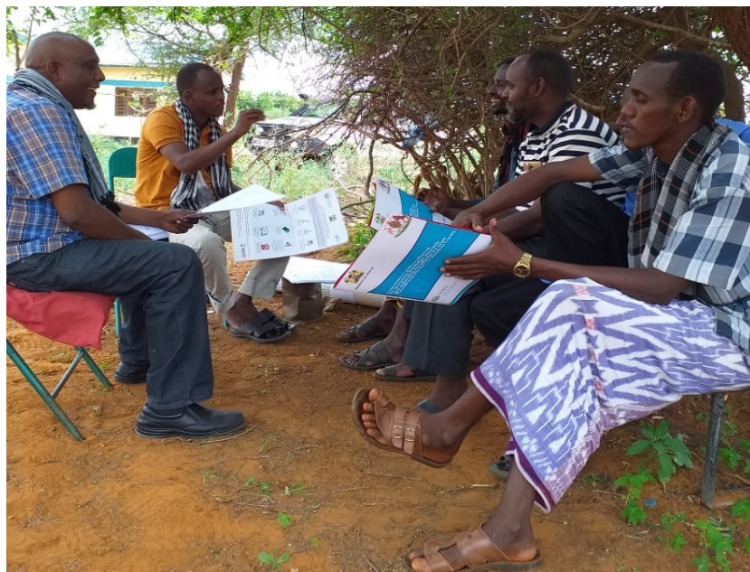
WHO & CGPP Mandera team sensitizing the Health Care workers on AFP and Zoonotic Surveillance.