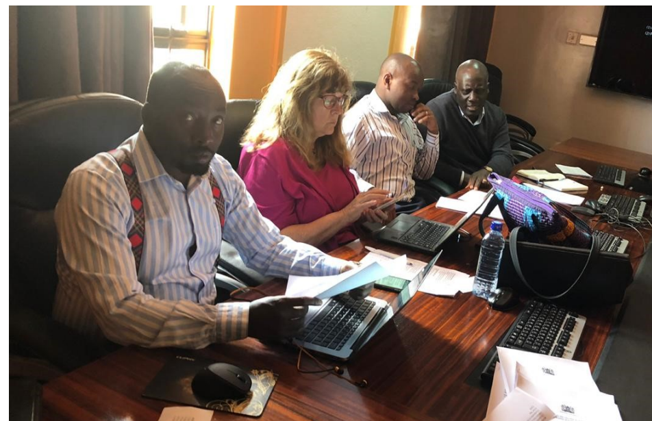
Participants during the MoH partners Polio SIA planning meeting.