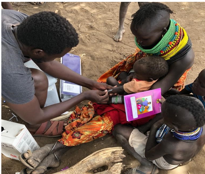
Immunization outreaches in Kakuro - Kibish Sub County—Turkana