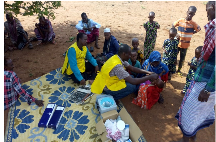
Targeted immunization outreach sessions in Damajaley dispensary , Dadaab SC