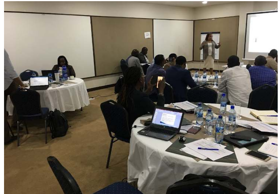
UNICEF supported C4D Training for CORE Group & its implementing partners