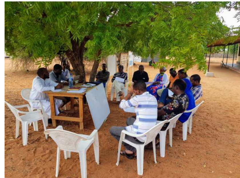
HFIs in-charges, CGPP/WVK and CMs meeting.