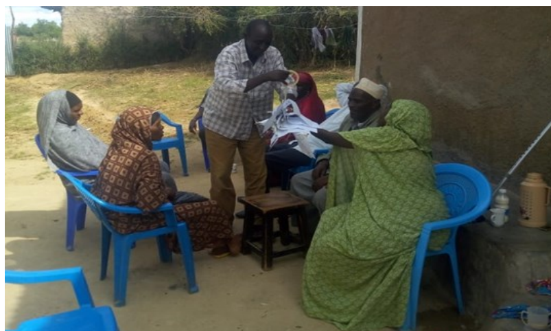
CHV/CHA training on routine immunization and Surveillance in North Horr