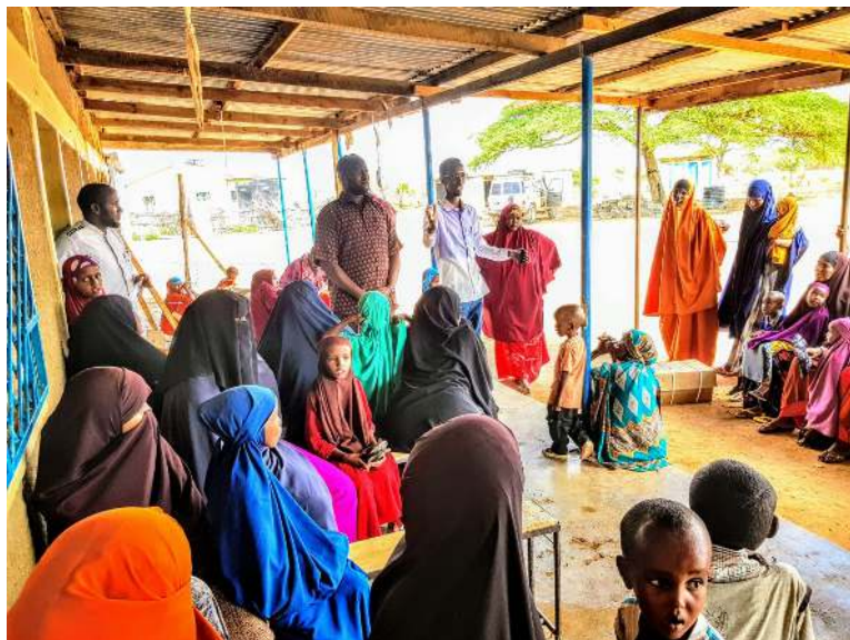
Social mobilization at Biyamadhow HC ,Wajir south.