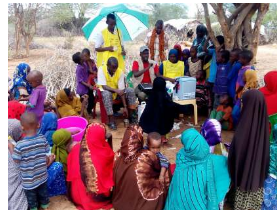
Outreach Session in Border village, Dadaab Sub-county.