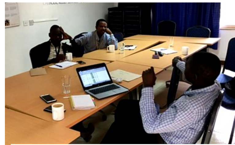
CGPP and CRS quarterly meeting