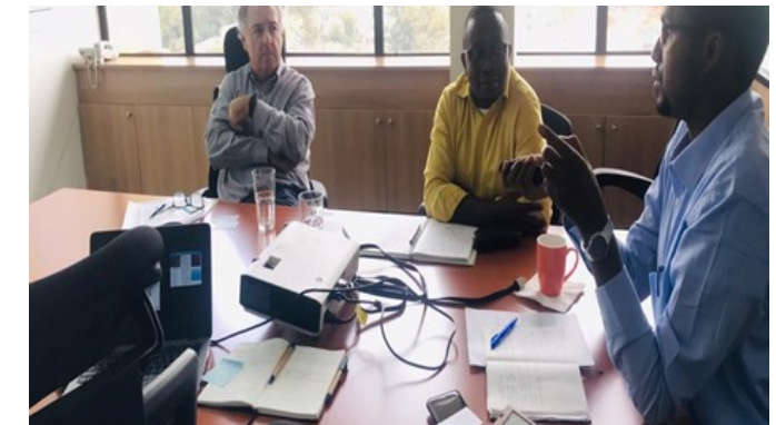
CDC Global migration and CGPP meeting