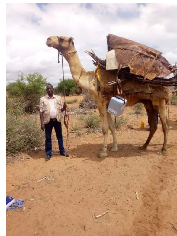
Outreach Sessions in migrating nomadic families, Hamey, Dadaab SC.