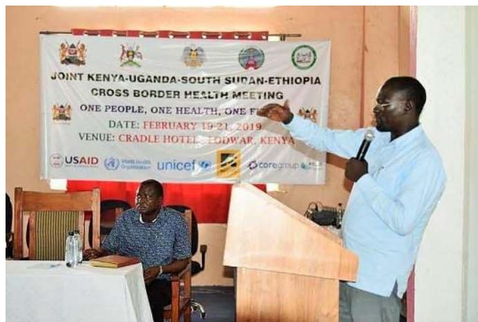
Figure 1: Turkana County Governor, Hon Josephat Nanok officiated the meeting.