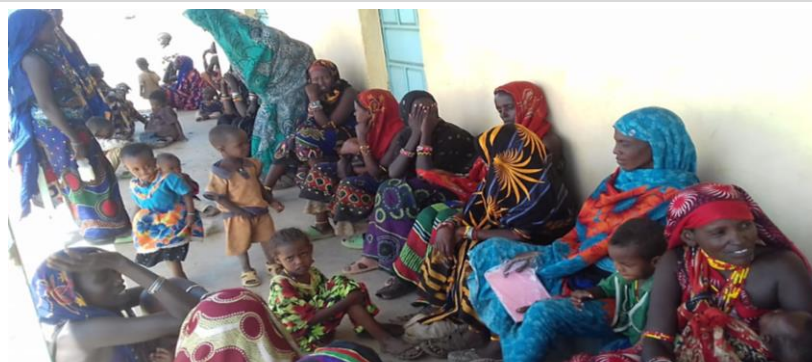
Figure 2:Community sensitization on the importance of polio and routine immunization in North Horr.