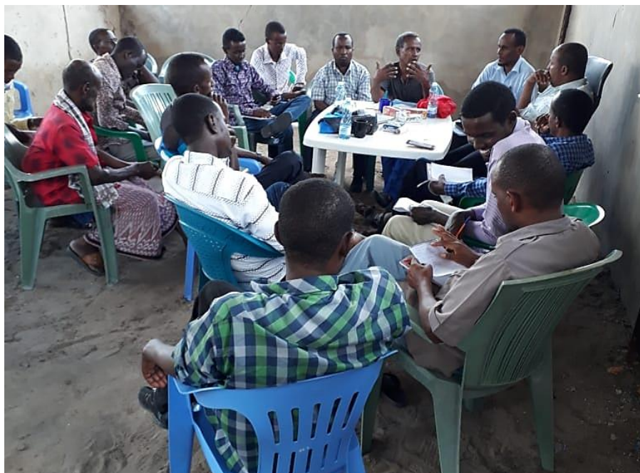
Figure 4: Cross-Border coordination meeting between Kulbiyow health team (Somalia) and Hulugho SCHMT (Kenya) at Kulbiyow town, Somalia.