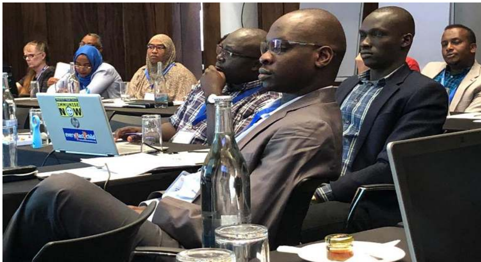
Figure 3: Data management & GIS training in Nairobi.