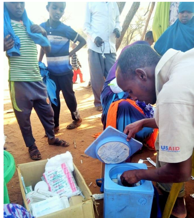
Figure 2: Outreach services at Gagaba in Mandera County, Kenya-Ethiopia border