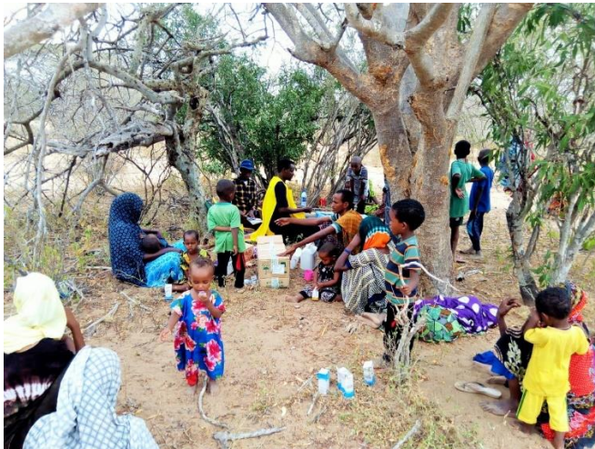
Figure 3: Immunization outreach services targeting nomadic pastoralist at Amuma Border post in Garissa County