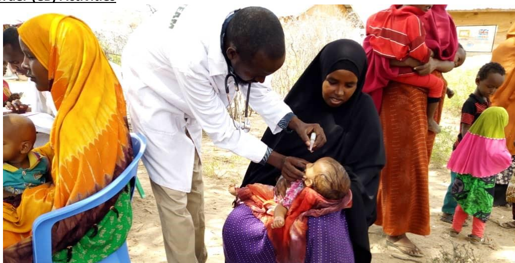
Figure 1: Immunization outreach in Lower Juba, Somalia