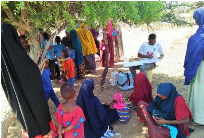
Figure4: Outreach services at Biyamathow in Wajir County, Kenya-Somalia border