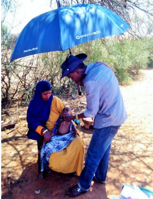
Figure 2: CM Eymole HC, Mandera attends to a sick child during defaulter tracing