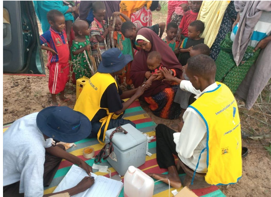
Figure 1: RI Outreach at Amuma border village, Garissa