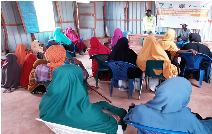
Figure 1: M2M awareness on AFP surveillance and RI in Dollow, Somalia