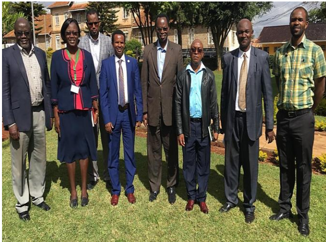
Figure 4: GHSA introductory visit to Directorate of Veterinary Dept