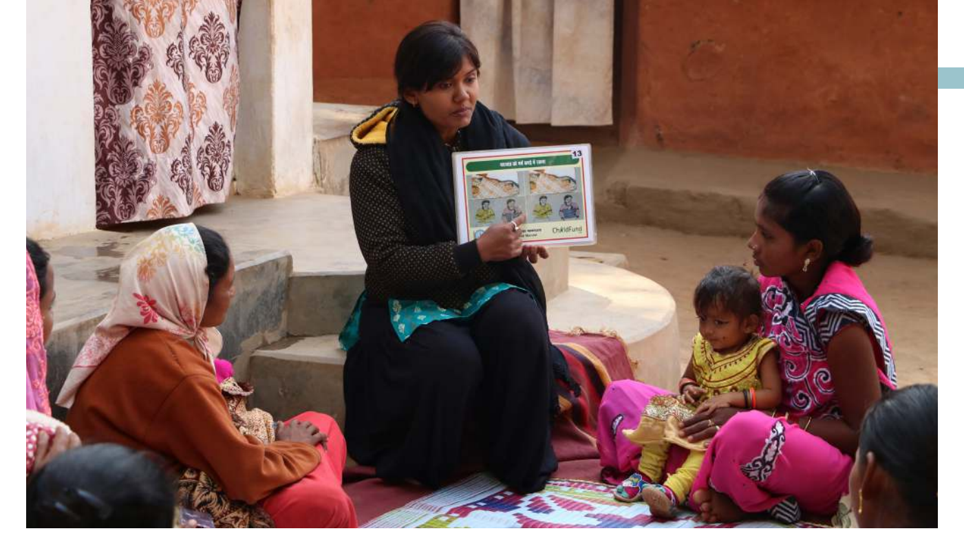
ChildFund Community Mobilizers are involved in facilitating the assessment and scaling up of the Positive Deviance (PD) approach in the community.