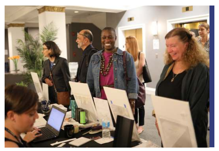
Registration at CORE Group's Global Health Practitioner Conference in Fall 2017.

The fact that the conversations are very grounded and very connected to the field is my biggest takeaway from CORE Group conferences. Every single time."