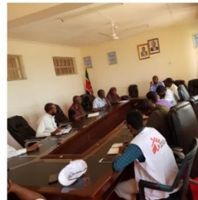
Figure 7,8 : SIA vaccination teams in Somalia (Elwak district)