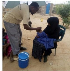
Figure 3: SIAs Launch in Hulugho sub-county in Garissa County, Kenya