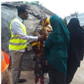
Figure 5,6: SIA teams border villages in Wajir County, Kenya