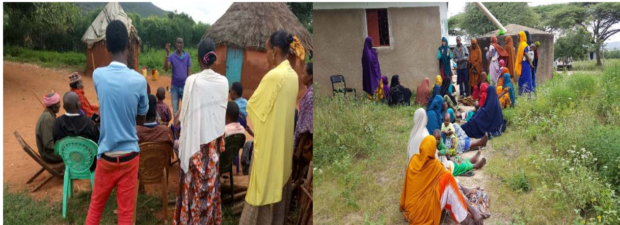
Figure 2: CMs conducting community sensitization on community-based AFP surveillance in Anona & Heilu villages in Marsabit