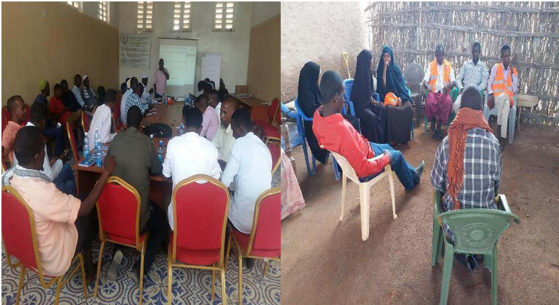
Figure 1: CMs and CHVs SIA and AFP planning workshop in Gerille and Elwak, Gedo, Somalia