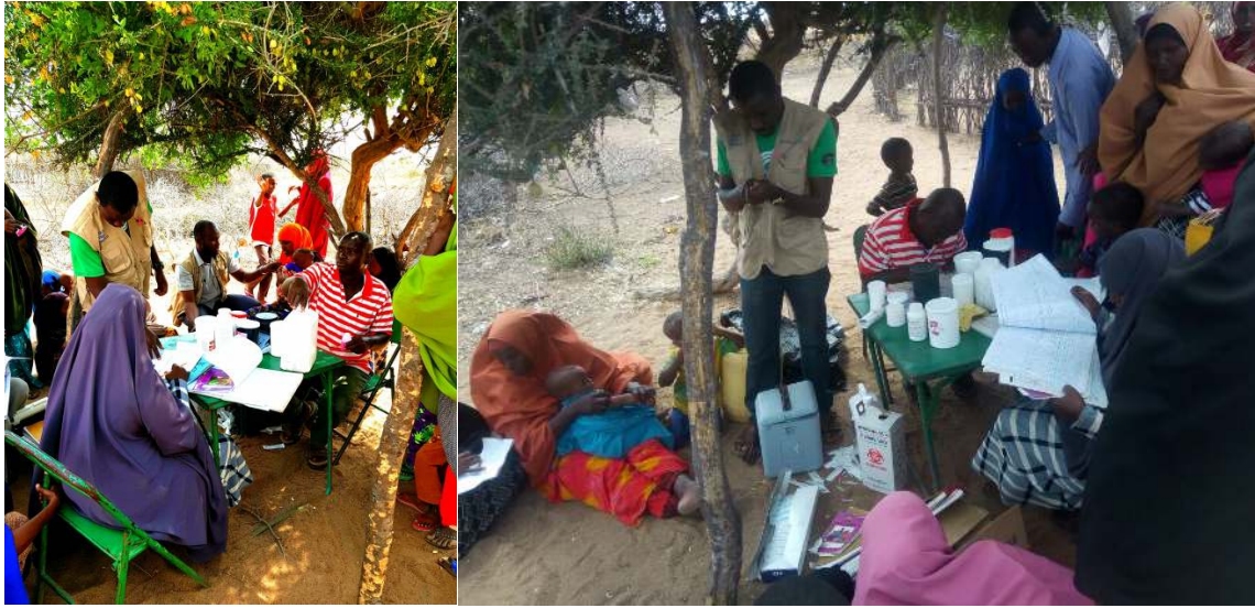
Figure 3: Outreach services to nomadic communities in Wajir South