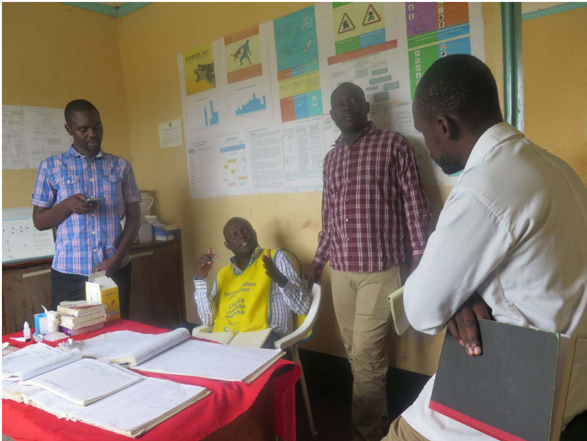
Figure 5: Support supervision at Nanaam Health Center, Turkana County