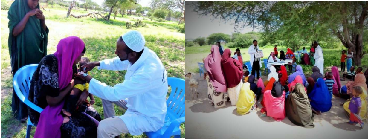
Figure 2: Immunization outreach at Dagax, Hamajo villages in Dhobley, Somalia