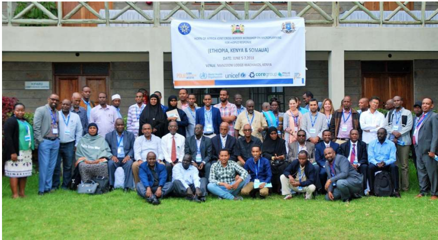
Figure 1: Group photo of HOA cross-border forum at Machakos, Kenya