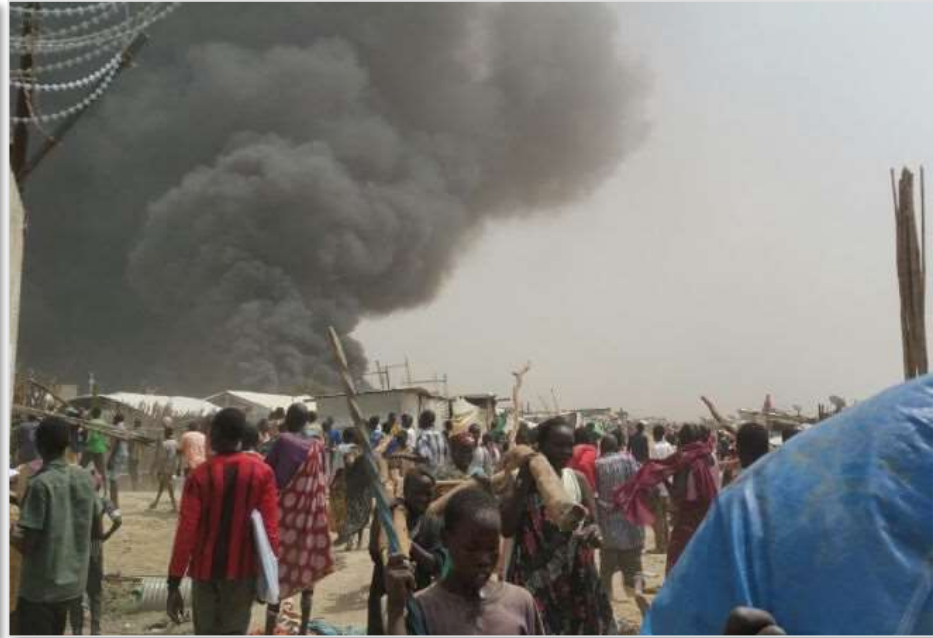
Malakal Camp 2015