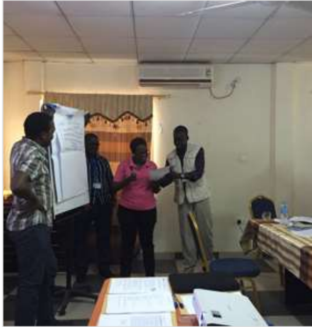
Program Manager Workshop