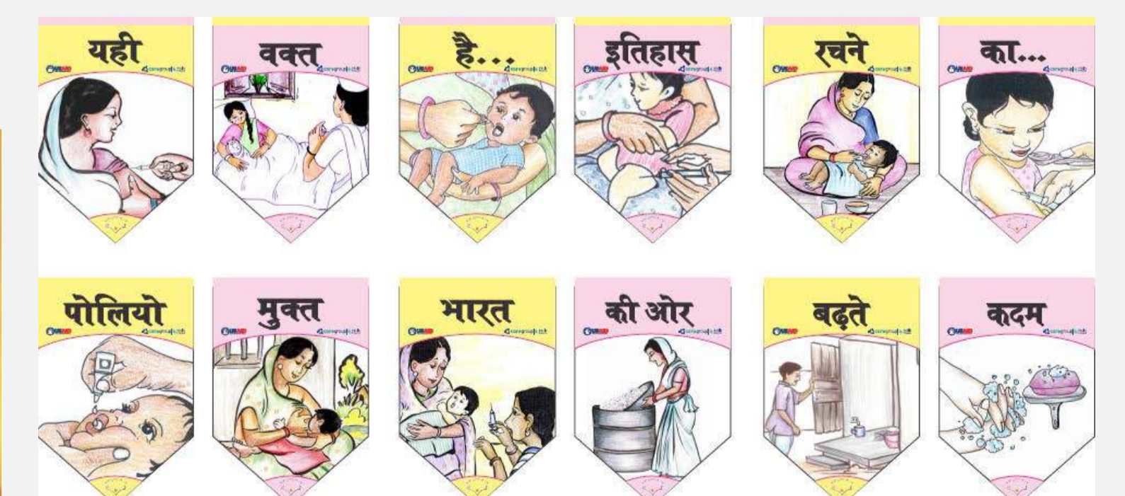
Communication materials used

More than 1200 informers were enrolled and a total of 1400 sites were identified and incorporated in the micro plans. Decrease in the number of missed children among mobile population in Uttar Pradesh for polio vaccination i.e 9% to 4.5%.