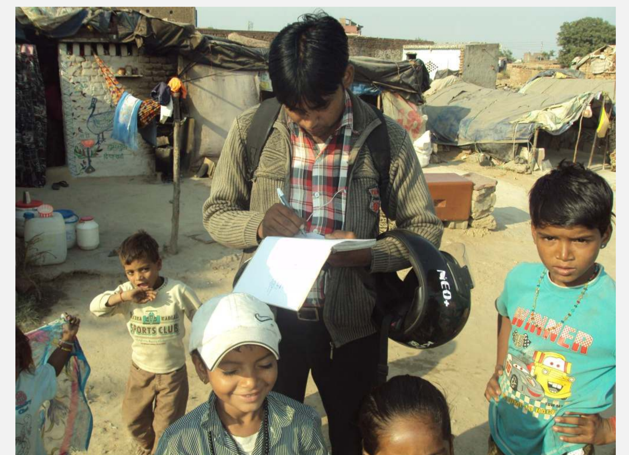
Each household & child status was recorded